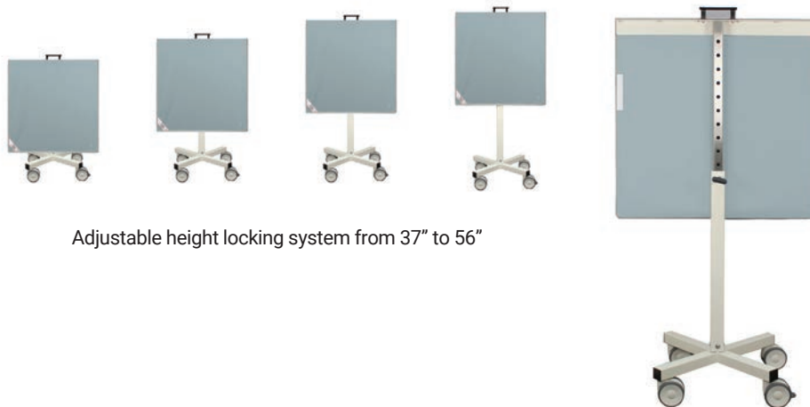
Adjustable height locking system from 37" to 56"