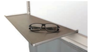
076994-IT Optional 9"x 24" Stainless Steel Instrument Tray