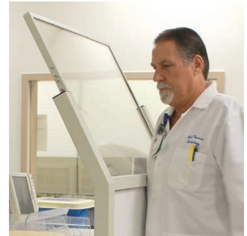
Tilted design for better view