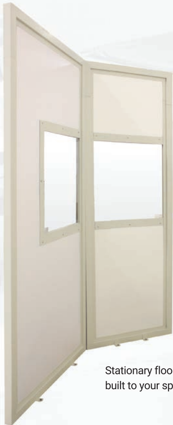
Stationary floor and wall-mounted barriers, built to your specifications.