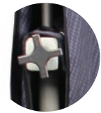
Easy to adjust height